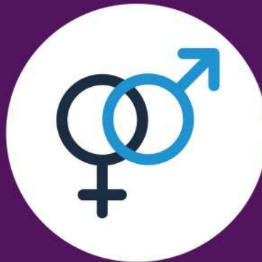
Gender Equality Women Empowerment