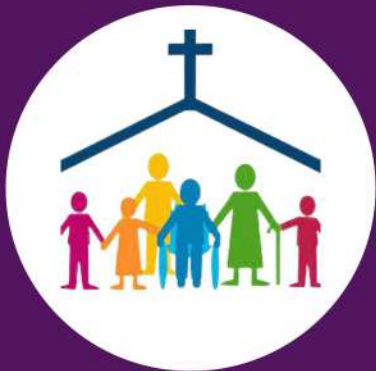
Church Community Transformation